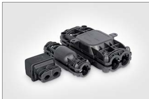
Relilight gel cable joint.