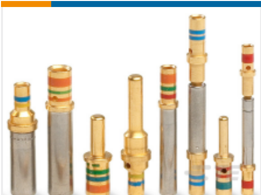
TE Model / Part #2562-201-2031L CONT SOC ASSY