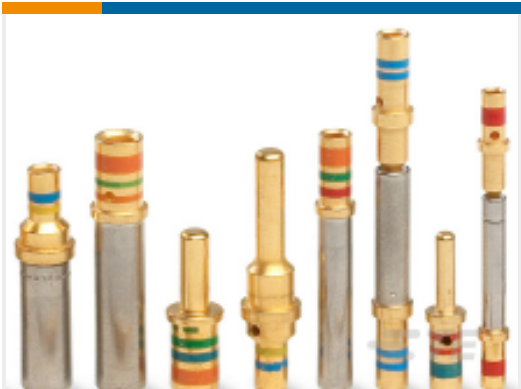
TE Model / Part #38943-20L CONTACTS (=724-0007-20)