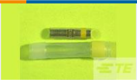
TE Model / Part #650075-000 D-436-37