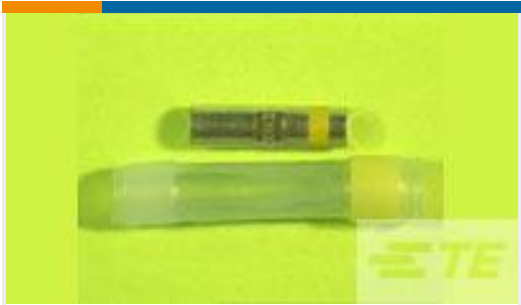
TE Model / Part #650076-000 D-436-38