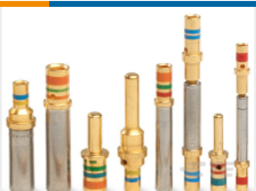
TE Model / Part #38941-22L CONTACTS