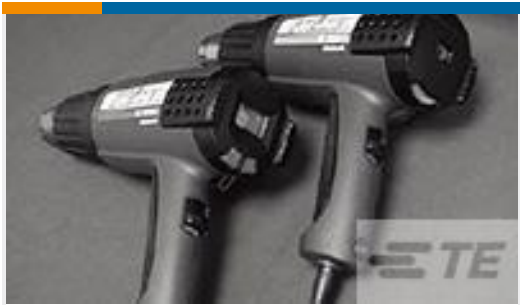
TE Model / Part # CJ2087-000 HL2010E-KIT-120V

This information is provided based on reasonable inquiry of our suppliers and represents our current actual knowledge based on the information they provided. This information is subject to change. The part numbers that TE has identified as EU RoHS compliant have a maximum concentration of 0.1% by weight in homogenous materials for lead, hexavalent chromium, mercury, PBB, PBDE, DBP, BBP, DEHP, DIBP, and 0.01% for cadmium, or qualify for an exemption to these limits as defined in the Annexes of Directive 2011/65/EU (RoHS2). Finished electrical and electronic equipment products will be CE marked as required by Directive 2011/65/EU. Components may not be CE marked. Additionally, the part numbers that TE has identified as EU ELV compliant have a maximum concentration of 0.1% by weight in homogenous materials for lead, hexavalent chromium, and mercury, and 0.01% for cadmium, or qualify for an exemption to these limits as defined in the Annexes of Directive 2000/53/EC (ELV). Regarding the REACH Regulation, the information TE provides on SVHC in articles for this part number is based on the latest European Chemicals Agency (ECHA) 'Guidance on requirements for substances in articles' posted at this URL: https://echa.europa.eu/guidance-documents/guidance-on-reach