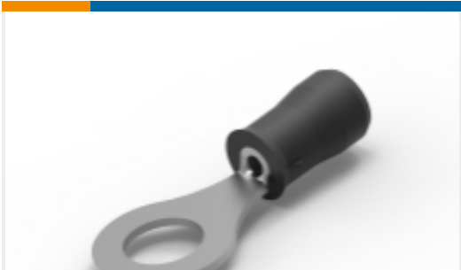
TE Model / Part #51863 PIDG RING TONGUE TERMINALS