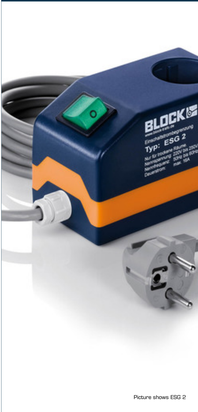
Picture shows ESG 2