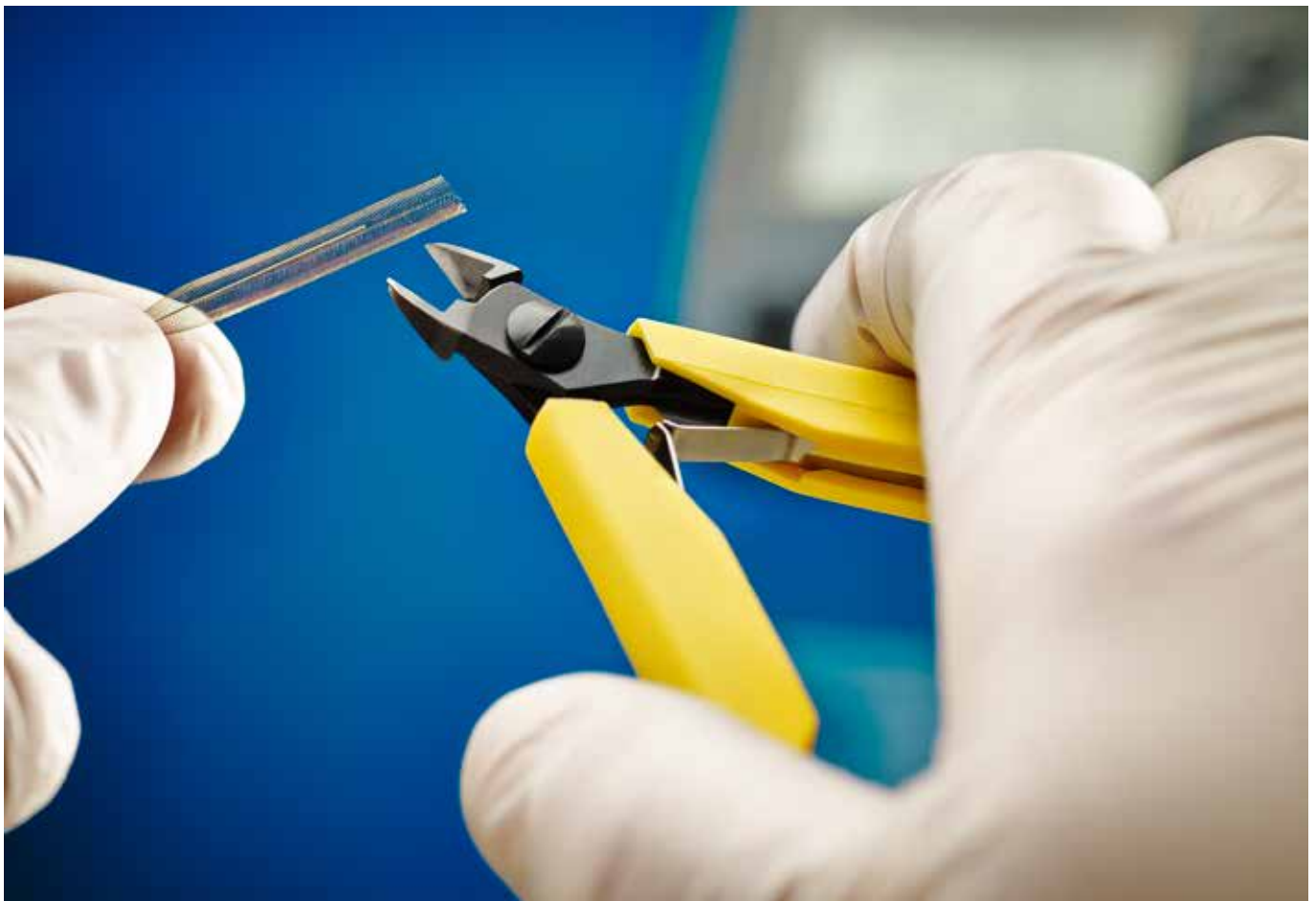
Stents can be trimmed with Lindström 8130 cutters.