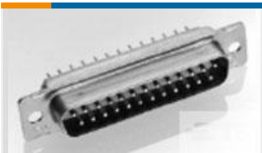
TE Model / Part #205561-2 RECEPT ASSY,37 POSN,AMPLIMITE