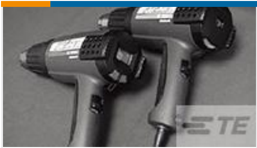
TE Model / Part # CJ2087-000 HL2010E-KIT-120V