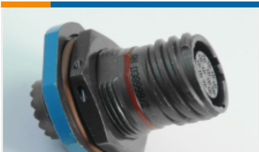
TE Model / Part #DTS24F11-35SN RECP ASSY