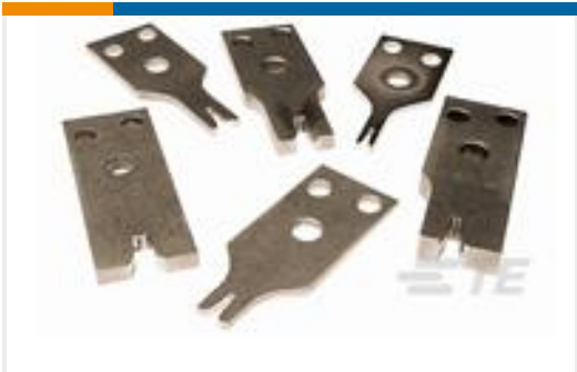
TE Model / Part #9-568176-6 CRIMPER, WIRE