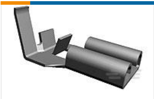
TE Model / Part #1-1627102-1 H2593B/R2500