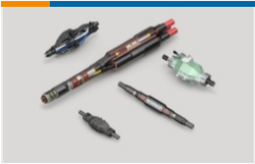
Joints & Splices(1)