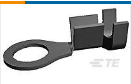
TE Model / Part #1-1627187-2 H430B/R2500