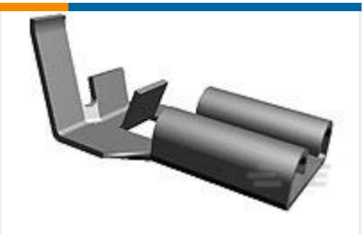
TE Model / Part #1-1627101-2 H2592B/R1300