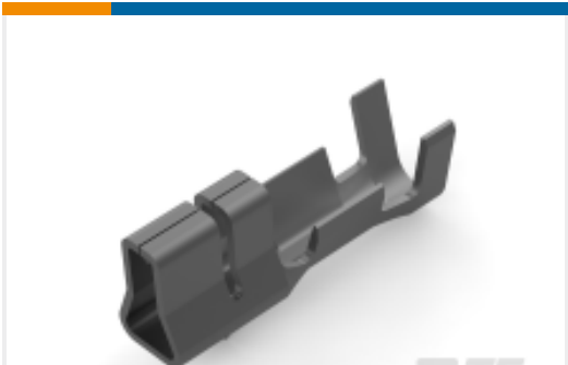
TE Model / Part #9-917684-1 2.5 SGL DBL LOCK REC CONT