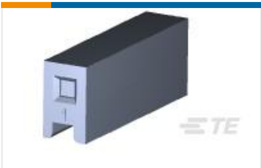
TE Model / Part #640251-1 01P SL156 HSG W/O RAMP NATL