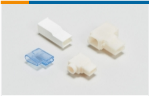
Crimp Terminal Housings(38)