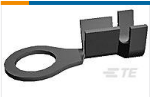
TE Model / Part #41911 RING 190(4.82 MM) TERMINAL 12-10 AWG BR