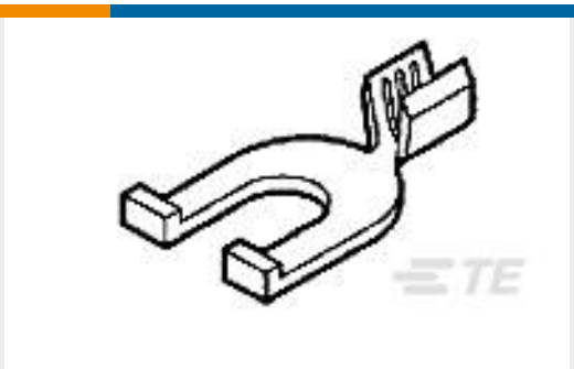
TE Model / Part #63526-1 FLANGED SPADE TERMINAL 12-10 AWG BR