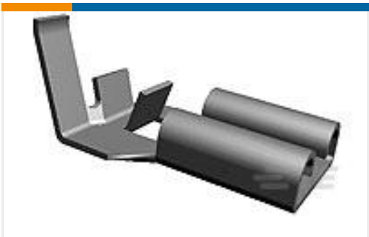
TE Model / Part #1-1627102-4 UH2593ET/R2500