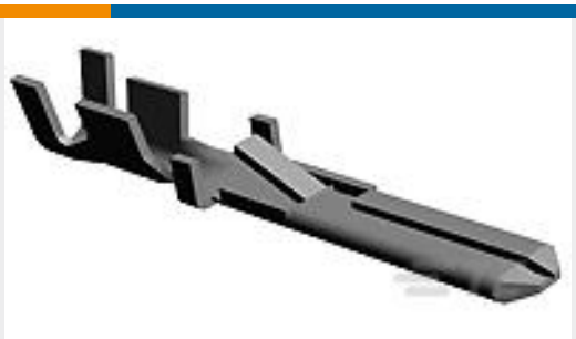
TE Part #928931-2 FF 110 (2.8 X 0.8 MM) TAB PTP CUZN30