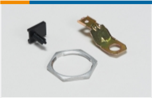
Other Automotive Connector Accessories(1)