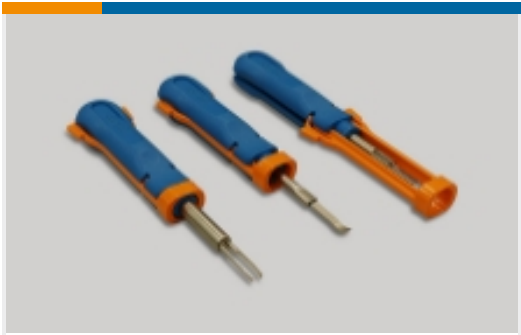
Insertion & Extraction Tools(9)