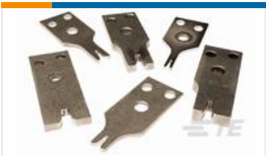
TE Part #6-683454-5 CRIMPER, INSULATION, "O"