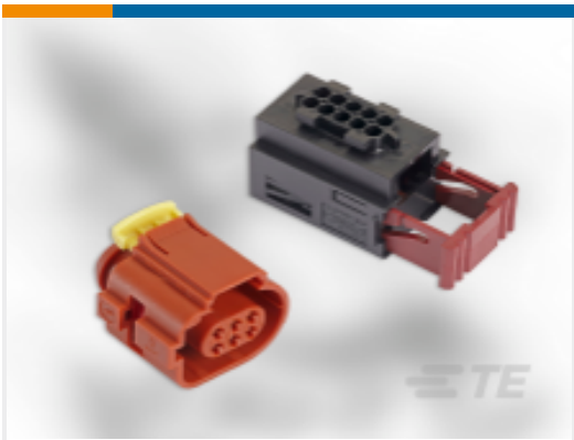
TE Part #929505-7 TIMER, CONNECTOR HOUSING