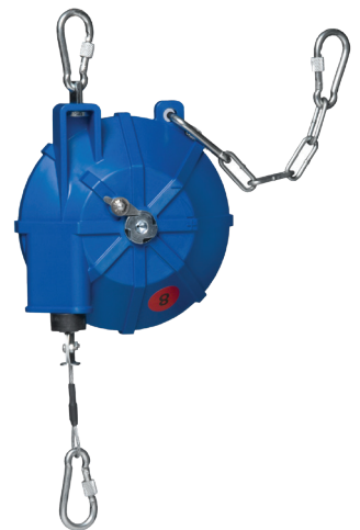
AB Model, Rear View