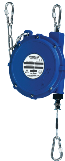
AB and ABRL Model, Front View