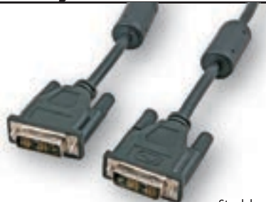
Stock lengths: 2.0 - 3.0 - 5.0 - 10 - 15 - 20 m

Shielding: foil + braiding Conductor: bare copper, Jacket: PVC Plugs and contacts gold plated and moulded Both sides assembled with ferrite core to dejam signals in the cable (better EMC characteristics) Cable length up to 20m! Single Link cable Support resolutions up to 1920 x 1200