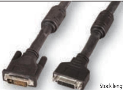
Stock lengths: 2.0 - 3.0 - 5.0 - 10 m

Shielding: foil + braiding Conductor: bare copper, Jacket: PVC Plugs and contacts gold plated and moulded Both sides assembled with ferrite core to dejam signals in the cable (better EMC characteristics) Dual Link cable Support resolutions up to 2560 x 1600