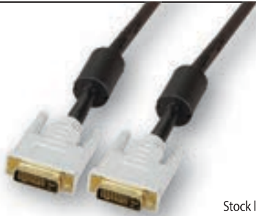
Stock lengths: 2.0 - 3.0 - 5.0 m

Shielding: foil + braiding + PIMF Conductor: bare copper, Jacket: PVC black Plugs and contacts gold plated and moulded Both sides assembled with ferrite core to dejam signals in the cable (better EMC characteristics) Dual Link cable with support of digital and analog signals Support resolutions up to 2560 x 1600