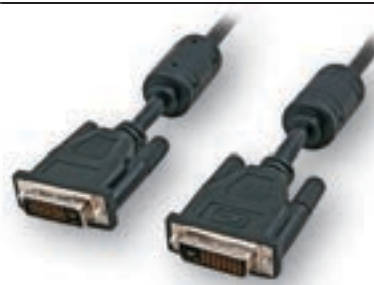
Stock lengths: 2.0 - 3.0 - 5.0 - 10 - 15 - 20 m

Shielding: foil + braiding Conductor: bare copper, Jacket: PVC Plugs and contacts gold plated and moulded Both sides assembled with ferrite core to dejam signals in the cable (better EMC characteristics) Cable length up to 20m! Dual Link cable Support resolutions up to 2560 x 1600