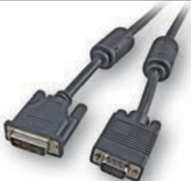
Stock lengths: 2.0 - 3.0 - 5.0 m

Shielding: foil + braiding Conductor: bare copper, Jacket: PVC Contacts gold plated, plugs moulded Both sides assembled with ferrite core to dejam signals in the cable (better EMC characteristics) Adapter cable from DVI-A to VGA