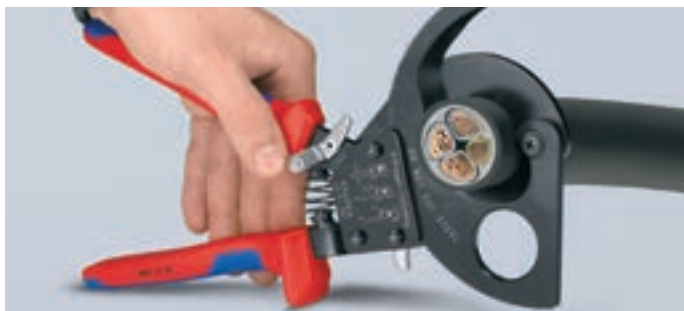
95 31 250/280: fixed handle with support area as an aid to position the cutters on a flat surface