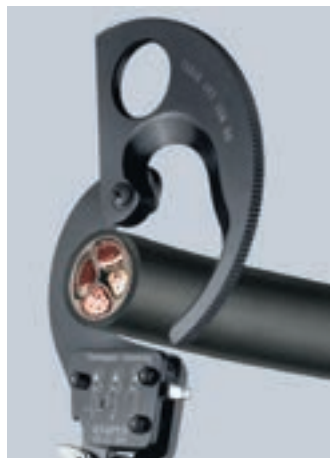
95 31 280: Large cutting capacity: maximum 52 mm dia. / 380 mm 2