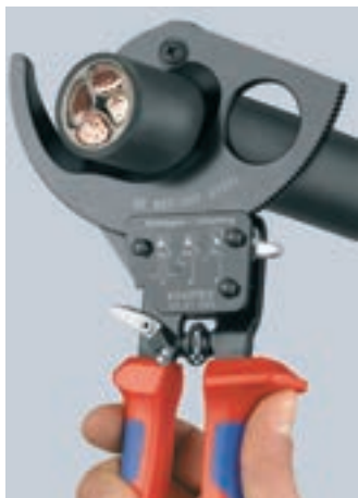
Ratchet principle and two-stage ratchet drive for easier cutting