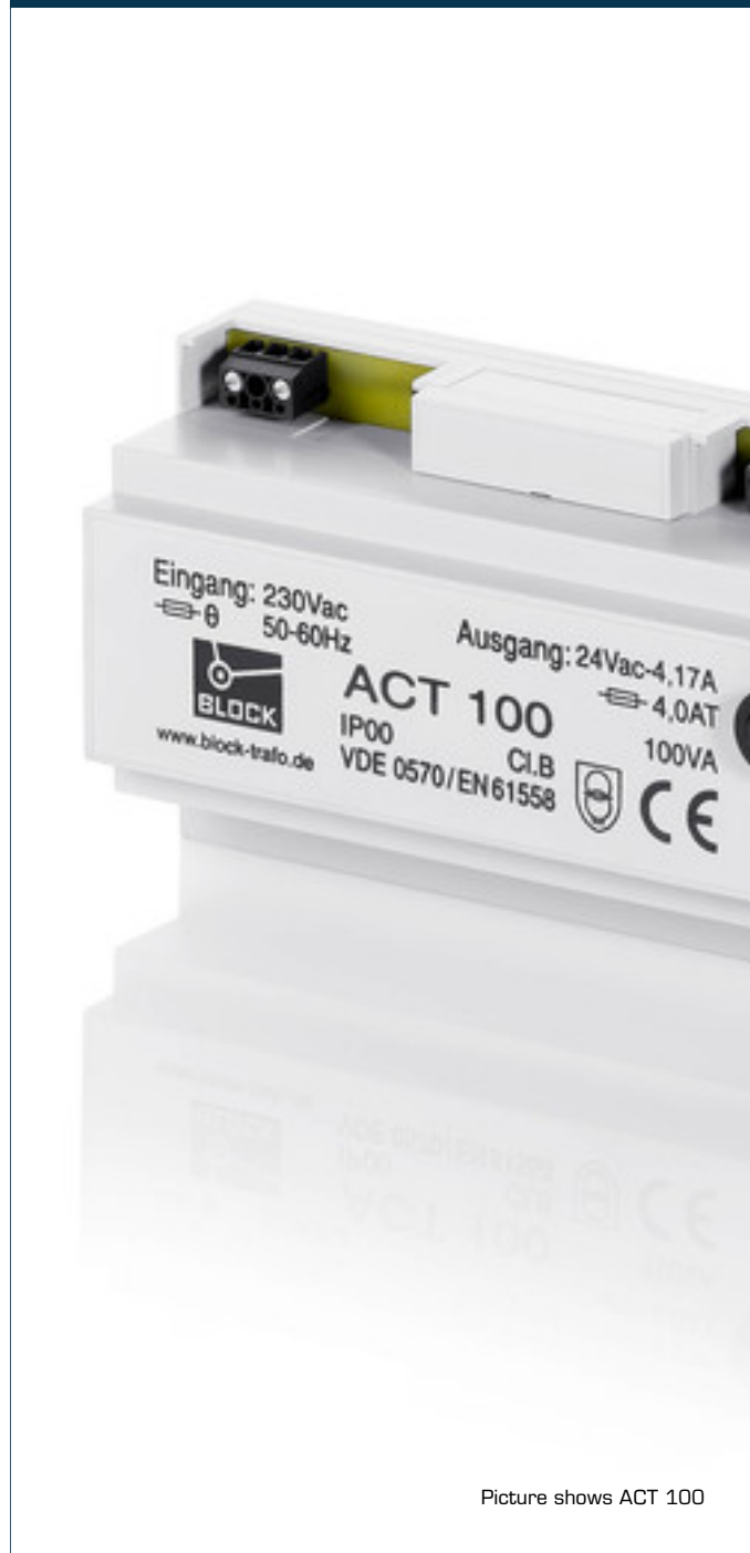
Picture shows ACT 100