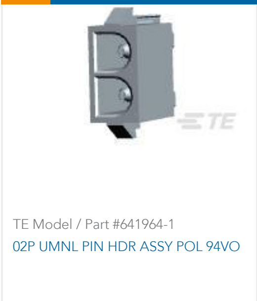
TE Model / Part #641964-1 02P UMNL PIN HDR ASSY POL 94VO