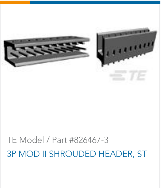
TE Model / Part #826467-3 3P MOD II SHROUDED HEADER, ST