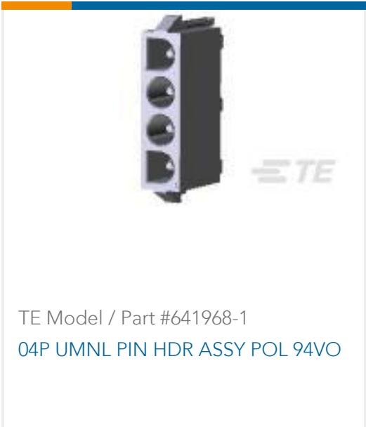
TE Model / Part #641968-1 04P UMNL PIN HDR ASSY POL 94VO