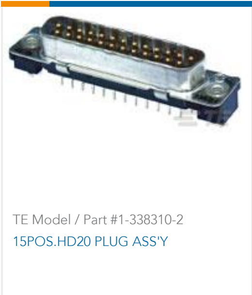
TE Model / Part #1-338310-2 15POS.HD20 PLUG ASS'Y