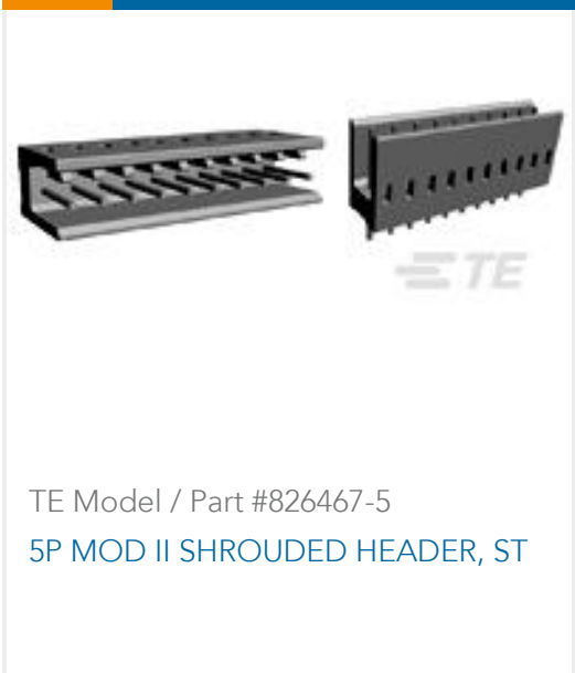
TE Model / Part #826467-5 5P MOD II SHROUDED HEADER, ST