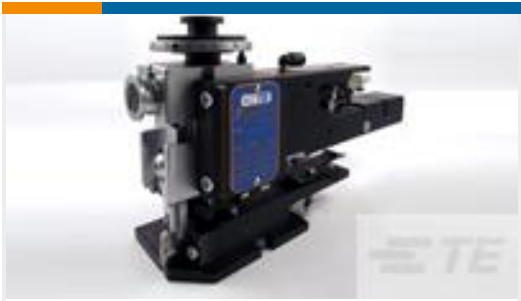
TE Model / Part #2150195-2 OC-AT-E-FA-110F140OV-001-0056