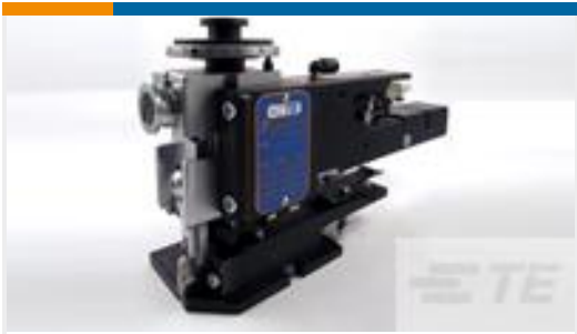
TE Model / Part #2150037-2 OCEAN_2.0_APPLICATOR-E-090F140F