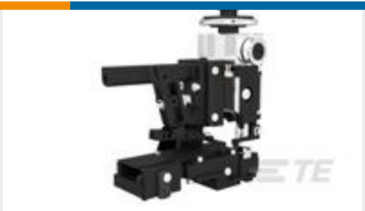
TE Model / Part #2151559-1 OCEAN_2.0_APPLICATOR-S-062F155O