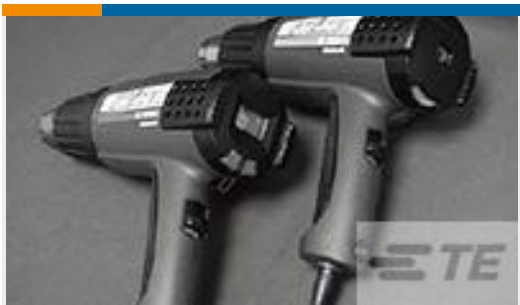
TE Model / Part # CJ2087-000 HL2010E-KIT-120V

This information is provided based on reasonable inquiry of our suppliers and represents our current actual knowledge based on the information they provided. This information is subject to change. The part numbers that TE has identified as EU RoHS compliant have a maximum concentration of 0.1% by weight in homogenous materials for lead, hexavalent chromium, mercury, PBB, PBDE, DBP, BBP, DEHP, DIBP, and 0.01% for cadmium, or qualify for an exemption to these limits as defined in the Annexes of Directive 2011/65/EU (RoHS2). Finished electrical and electronic equipment products will be CE marked as required by Directive 2011/65/EU. Components may not be CE marked. Additionally, the part numbers that TE has identified as EU ELV compliant have a maximum concentration of 0.1% by weight in homogenous materials for lead, hexavalent chromium, and mercury, and 0.01% for cadmium, or qualify for an exemption to these limits as defined in the Annexes of Directive 2000/53/EC (ELV). Regarding the REACH Regulation, the information TE provides on SVHC in articles for this part number is based on the latest European Chemicals Agency (ECHA) 'Guidance on requirements for substances in articles' posted at this URL: https://echa.europa.eu/guidance-documents/guidance-on-reach