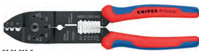
97 21 215 C