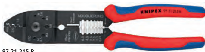
97 21 215 B