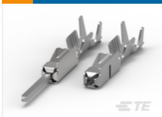
TE Part #968072-2 MQS, RECEPTACLE AND TAB