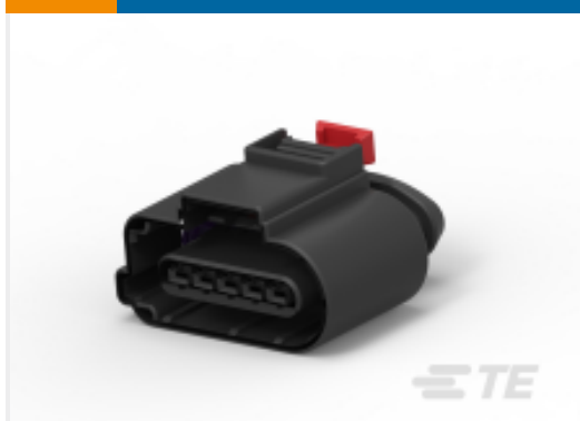
TE Part #2-2112780-2 AMP MCP, SEALED CONNECTOR HOUSING