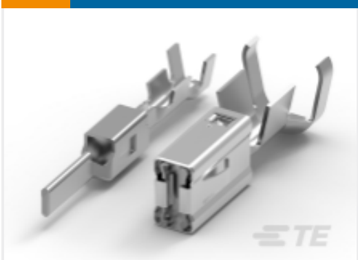
TE Part #1-967590-1 AMP MCP, RECEPTACLE AND TAB