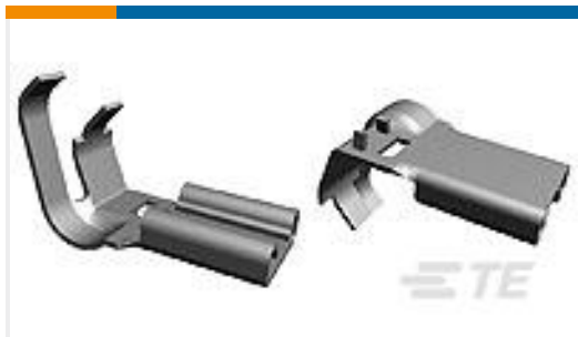
TE Part #141352-3 FASTON 110 FLAG 0.3-0.8MM BR