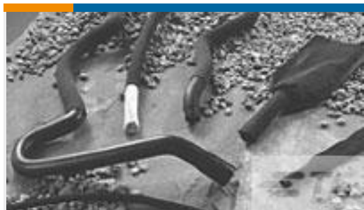
TE Part #2292184003 HFT5000-60/30-0-SP