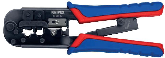
97 51 10