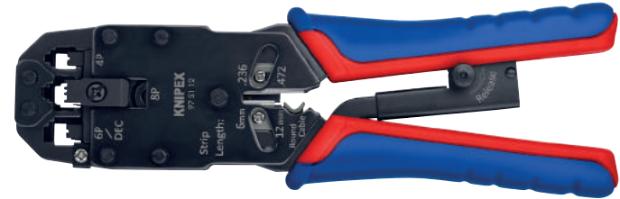
97 51 12