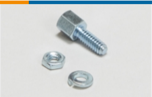
D-Sub Locking & Mounting(120)