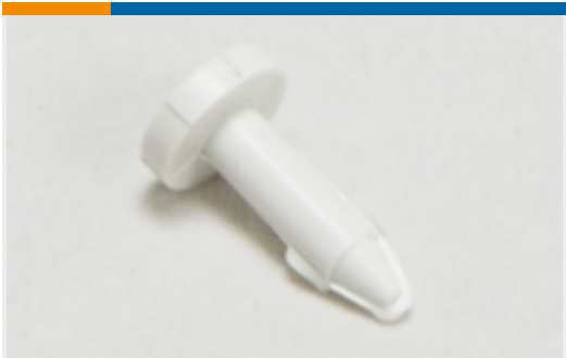
D-Sub Contact Accessories(1)