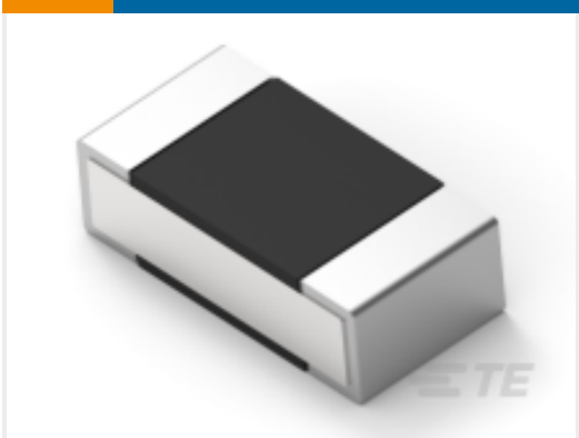
TE Part #2-2176306-1 RP 1E 0.1W 1K87 0.1% 25PPM 5K RL