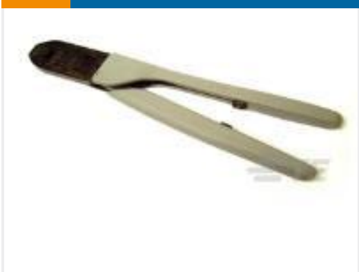
TE Part #91518-1 CCII AMPMODU SHORT POINT REC 32-22 ASSY