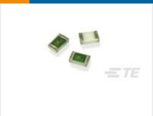
TE Part #2176087-9 RP 1J 0.166W 82R5 0.1% 25PPM 1K RL