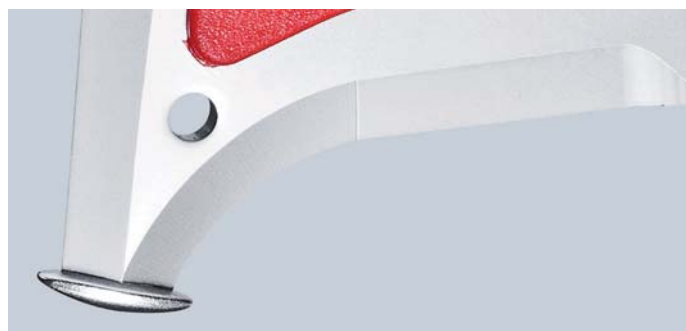
Guide shoe 98 55

solid, fixed hook blade, sickle shaped; with guide shoe at the blade point; no damage of the conductor insulation; blade: surgical steel, stainless, vacuum-hardened