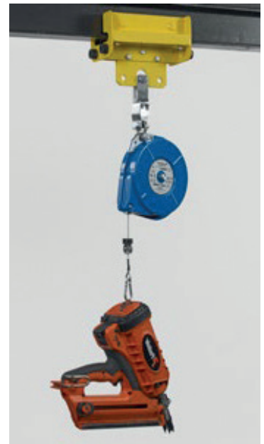
22F Model: Trolley with Nail Gun Application