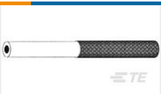
TE Model / Part #D561523001 RAY-101-4.0(100)