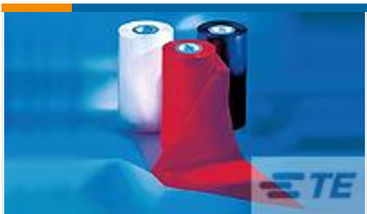
TE Model / Part #754073-000 TMS-RJS-RIBBON-4HT