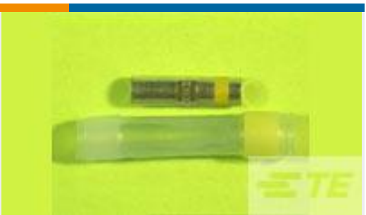
TE Model / Part #650082-000 D-436-58