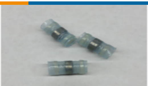
TE Model / Part #620005-000 D-104-00