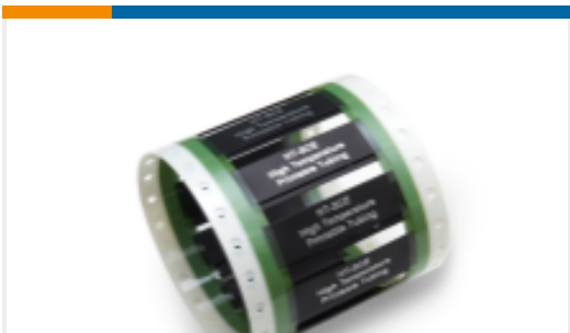
TE Model / Part #9410990001 HT-SCE HIGH TEMPERATURE SLEEVES